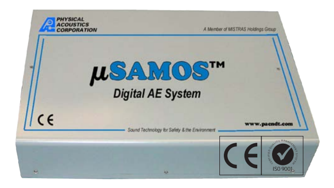
µSAMOS™ Chassis for up to 24 Channels of AE

PCI-8™ AE Subsystem boards occupy one full-size PCI slot in a computer chassis and can be implemented inside most standard PC computers or inside one of PAC's four (4) rugged, multichannel PAC SAMOS™ (Sensor based Acoustic Multichannel Operation System) system chassis, which include SAMOS-112/48/32 and µSAMOS™. Due to advances in surface mount technology and high density FPCA's devices, PAC has been able to provide this single AE System on a Board with 8 complete high speed, AE channels of acquisition waveform processing and transfer, 2 analog parametric input channels and 8 digital input and output control signals.